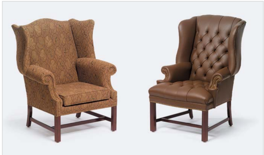
2831 | 2830T Traditional Lounge