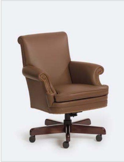
2811.5 Traditional Executive