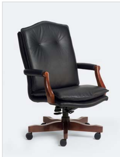
9820.5RA-2B Arlington with Buttons