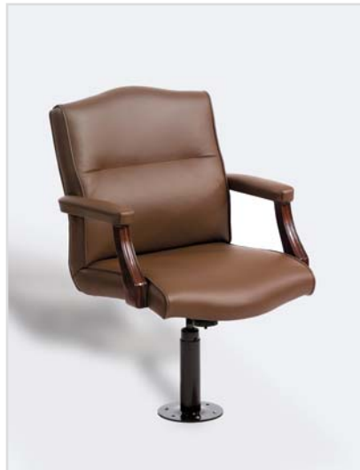
9815.5UA Arlington with Jury Base

Specialty requirements, such as courtroom jury bases, are easily met. Embossed state seals or corporate logos personalize your seating.