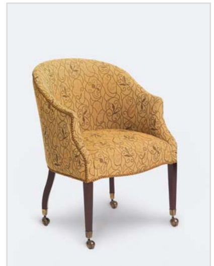
2816 English Hepplewhite