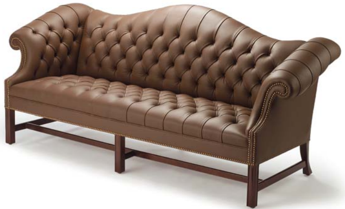
2880T Traditional Lounge