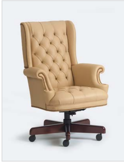
2813.5T Traditional Executive

Hand-fold tufting and brass nailhead trim are characteristic of Taylor's attention to detail. Beautifully-crafted hardwood frames are available in Chippendale and Hepplewhite variations, along with more transitional adaptations. Traditional Seating includes guest, swivel, conference room, and reception area styles.