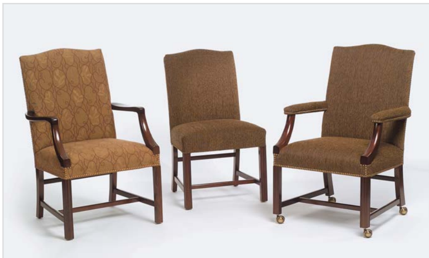
2806 | 2804 | 2806-4 Chippendale