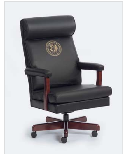
4800.5 Judge with Embossed Logo