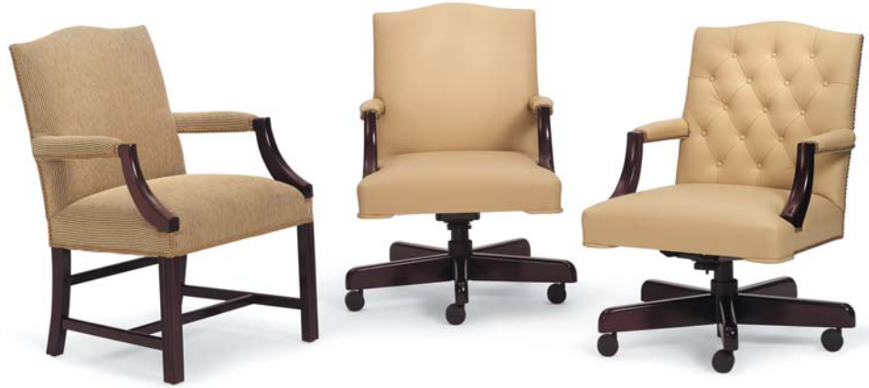
2808 | 2808.5 | 2808.5T Chippendale

The Traditional Seating collection is a stylish interpretation of 18th century designs, crafted using current technologies and time-honored techniques.