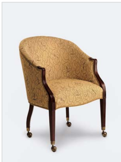
2814-4 English Hepplewhite